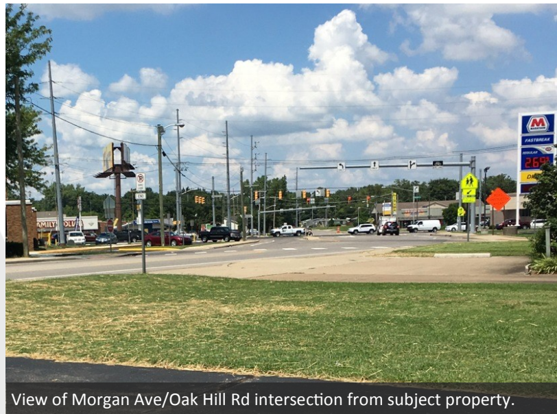
View of Morgan Ave/Oak Hill Rd intersection from subject property.

RICHARD CLEMENTS 812.746.8569 rclements@summitrealestate.us